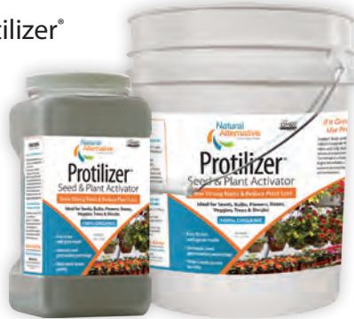
4 lbs covers 1½ acres

Natural Alternative® Protilizer® Seed & Plant Activator is rich in humic acid, kelp, mycorrhizae fungi and billions of proprietary beneficial microbes. These little powerhouses surround the roots to drastically reduce shock. Within just 24 hours, plant roots are absorbing nutrients in a healthier soil environment with fewer pathogens. Protilizer® is 100% organic and is OMRI® listed. Protilizer® directions: